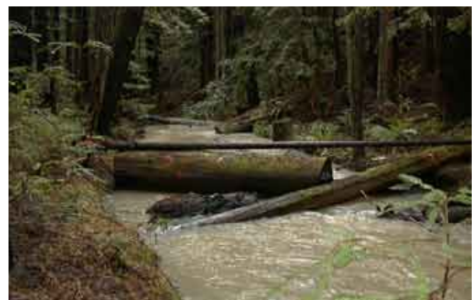
Jackson State Demonstration Forest