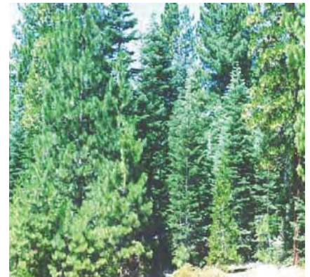
Much of what grows in California is fuel for wildfires.

Fire remains a major natural force in California. It is not a matter of "if" a fire will burn, it is "when". Therefore, it is important for Californians to understand that living in California means learning to live with fire.